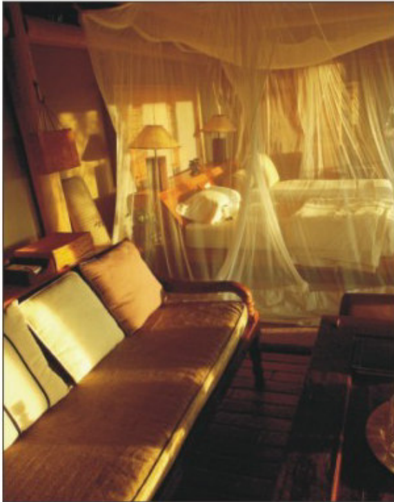
Mombo - Botswana