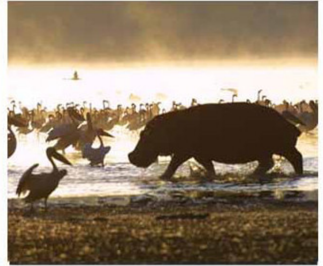
Wanyama wa Porini