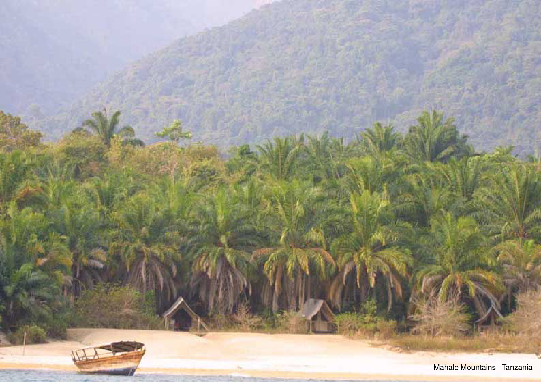
Mahale Mountains - Tanzania