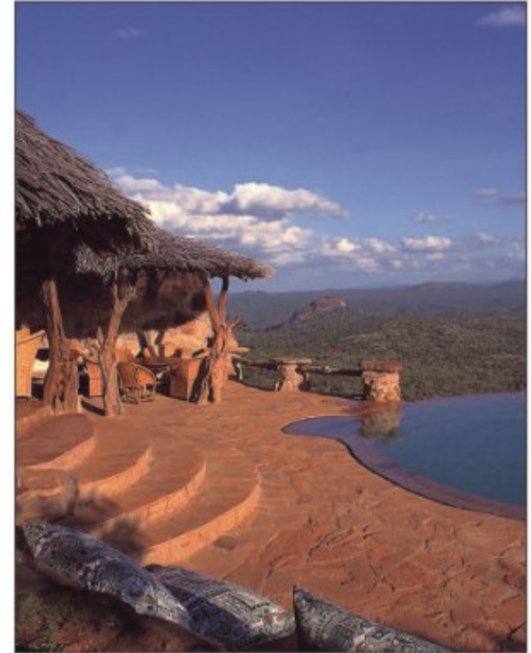
Ol Malo - Laikipia Plateau - Kenya