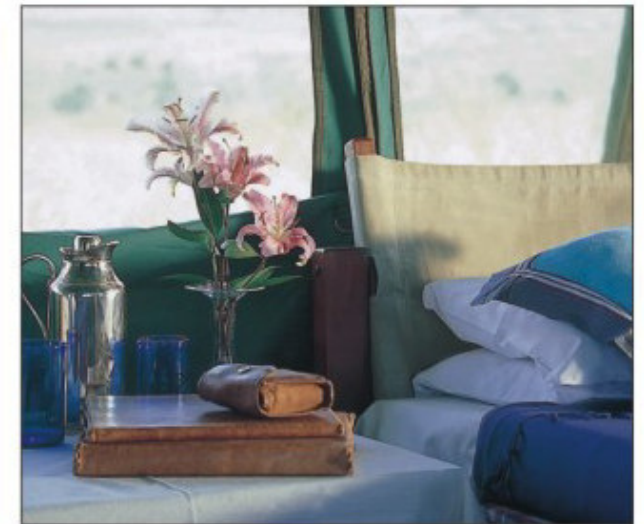
Sumptuous mobile safari camps Ustawi Porini